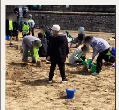
YEAR 2 AND YEAR 3 HAD A WONDERFUL TIME AT WESTON SUPER MARE