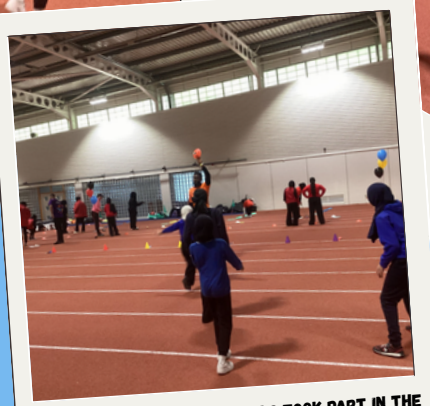
A GROUP OF OUR YEAR 6 GIRLS TOOK PART IN THE GIRLS OF BRUM EVENT AT THE ALEXANDER STADIUM