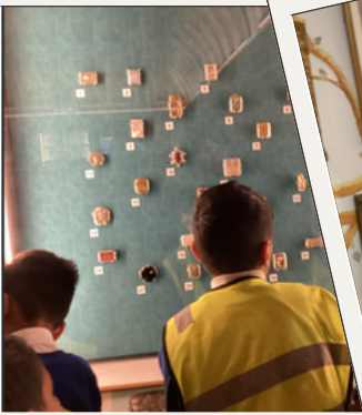
YEAR 4 VISITED THE BIRMINGHAM MUSEUM AS PART OF THEIR EGYPTIAN TOPIC.