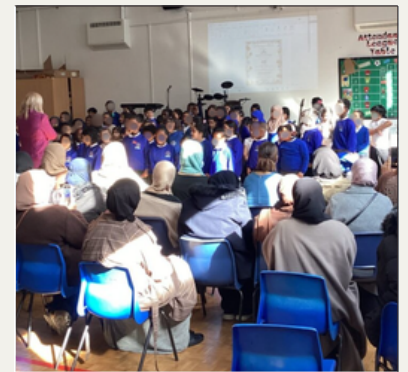
THE HEATH MOUNT CHOIR PUT ON A PITCH PERFECT PERFORMANCE THIS WEEK.