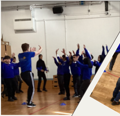
THE CHILDREN PUT ON A CREATIVE PERFORMANCE WITH THE HELP OF THE WEST END IN SCHOOLS PRODUCTION TEAM