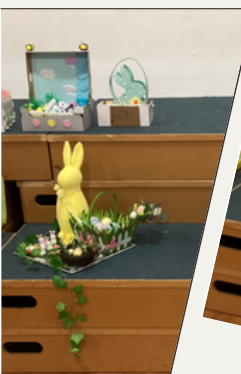
WE HAD A FANTASTIC ARRAY OF CREATIONS IN OUR EASTER EGG-DIORAMA COMPETITION. WELL DONE TO EVERYONE WHO PARTICIPATED.