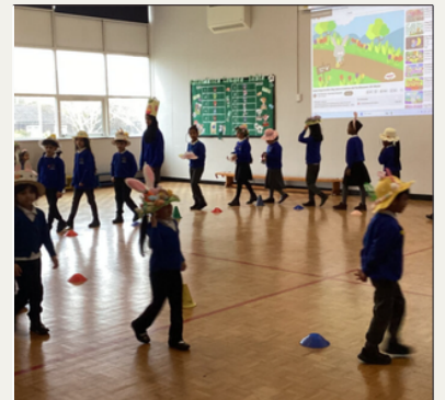
THE CHILDREN WERE VERY EGG-CITED TO TAKE PART IN OUR ANNUAL EASTER BONNET PARADE, SHOWCASING THE CREATIVE SKILLS OF OUR WONDERFUL PUPILS.