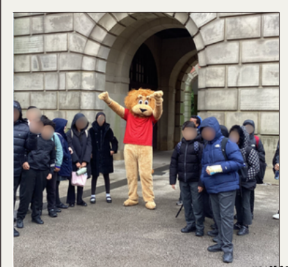
YEAR 6 VISITED THE UNIVERSITY OF BIRMINGHAM AS PART OF MOVE ON UP DAY TO HELP PUPILS DISCOVER MORE ABOUT UNIVERSITY LIFE.