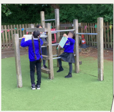
YEAR 3 WERE ON AN IMPORTANT AND EXCITING MISSION IN THE PLAYGROUND, SEARCHING FOR SHAPES WITH RIGHT ANGLES AS PART OF THEIR MATHS LESSON.