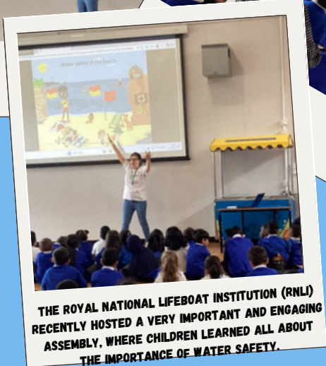
THE ROYAL NATIONAL LIFEBOAT INSTITUTION (RNLI) RECENTLY HOSTED A VERY IMPORTANT AND ENGAGING ASSEMBLY, WHERE CHILDREN LEARNED ALL ABOUT THE IMPORTANCE OF WATER SAFETY.