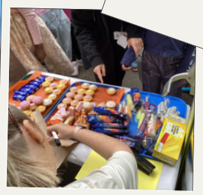
WHAT A FANTASTIC CAKE SALE WE HAD TODAY! THANK YOU SO MUCH TO EVERYONE WHO CONTRIBUTED SUCH A WONDERFUL VARIETY OF CAKES AND TREATS. YOUR GENEROUS DONATIONS, CREATIVITY, AND EFFORT MADE THE EVENT A HUGE SUCCESS.