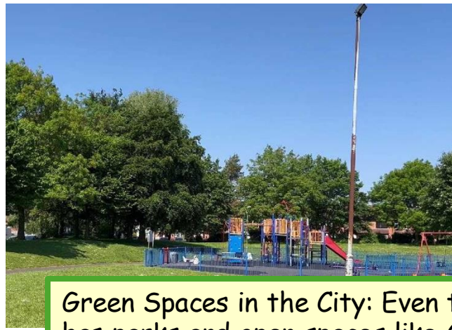
Green Spaces in the City: Even though it's in a city, Balsall Heath has parks and open spaces like Calthorpe Park and Pickwick Park, which are important for the environment and wildlife.